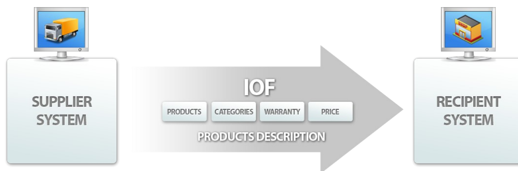
Schematics no. 1, The IOF principle of operation.

The IOF for Shops format uses meta-data to describe products for the IAI Downloader . It is not essential to use exactly that program. This format is ultra portable and can be used in any applications processing full data of products - for the needs of e-commerce. The IOF for Shops format describes products in integration process between supplier and seller (distributor), who wishes for the widest assortment and the best conditions of sale (Schematics no. 1).